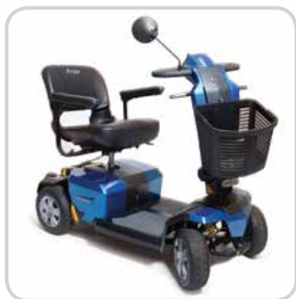
Shown in True Blue