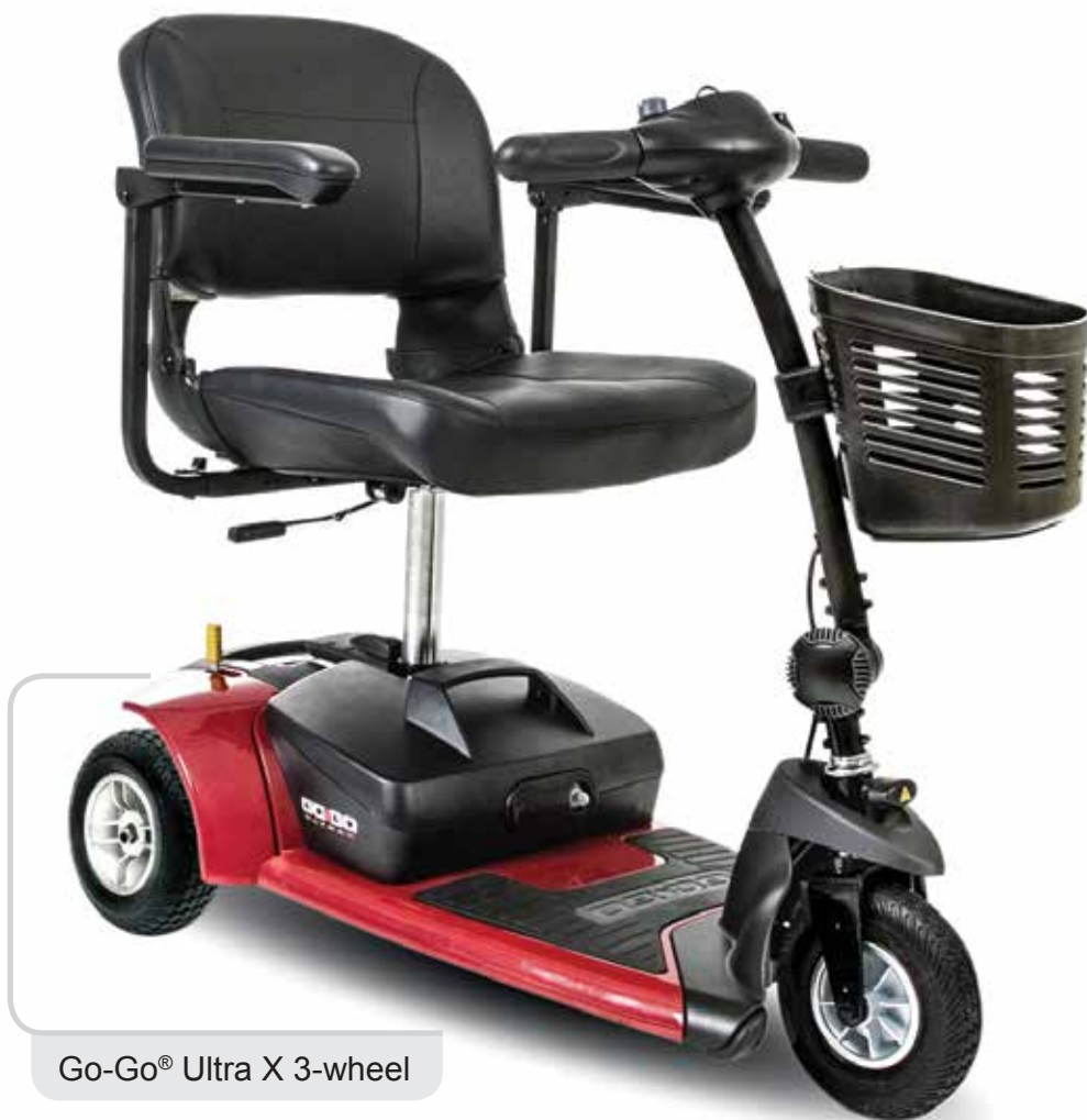
Go-Go ® Ultra X 3-wheel

The Go-Go ® Ultra X is loaded with features such as one-hand disassembly and a convenient drop-in battery box for worry-free travel. With a 260 lb. weight capacity, a maximum speed up to 4 mph, speeds up to 6.9 mph on the 3 wheel and 7.2 miles on the 4-wheel makes it an exceptional value.