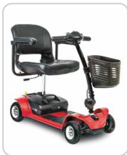
Go-Go ® Ultra X 4-wheel